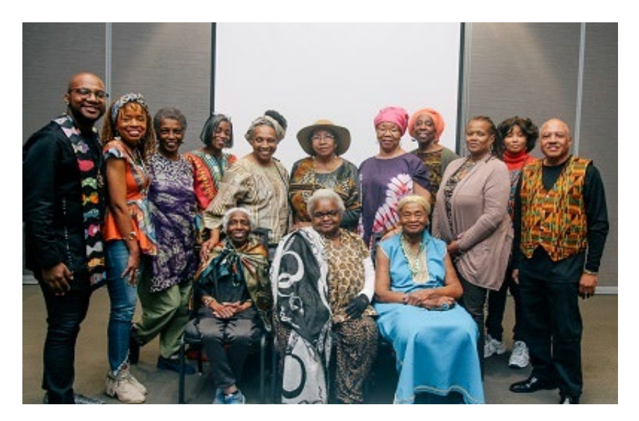
Affiliate Presidents at the 37th NABS Festival & Conference

1 College Affiliate, Johnson C. Smith College in North Carolina